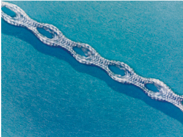
Figure 1: Example of branched textile structure

consistent product quality can most likely lead to better patient outcome and satisfaction. This new braiding technology, for loop-like structures, offers a high potential for the automated manufacturing of a branched structure in a single-step performing process. This branched-like structure resembles an eyelet and is the defining element of this new interface (Figure 1). Pairing the unique material properties of Dyneema Purity® fibers - the market's first medical-grade ultra-high molecular weight polyethylene fiber - with this new braiding technology, led to a series of novel interface devices demonstrating promising mechanical results, even using a Dyneema Purity® fiber as small as 55 dtex.